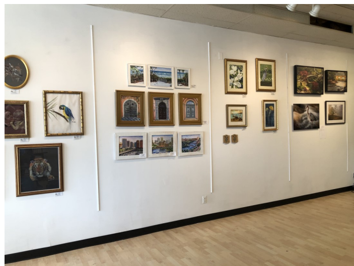
BAAA art on exhibit at McCool's Frame Shop Gallery